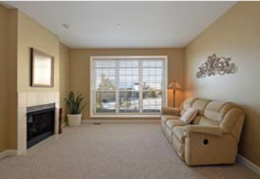
Year Built: 2006 Approx. SF: 3,116 Bedrooms: 3 Baths: 2.1

Garage: Attached, 2 Car Basement: Full, English, Unfinished, Bathroom Rough-In